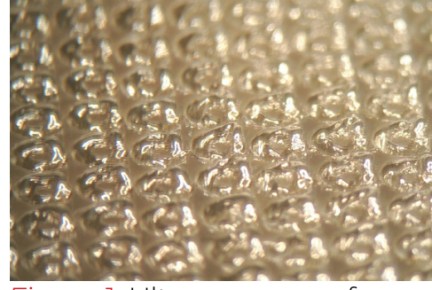
Figure 1. Ultra-coarse surface.

A gallery of applications can be found on the reverse. Surfi-Sculpt is a trade mark of TWI Ltd.