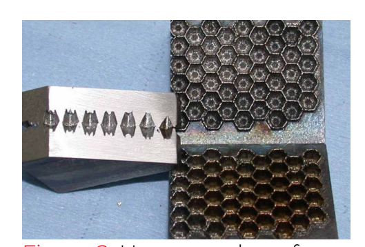
Figure 2. Honeycomb surface.