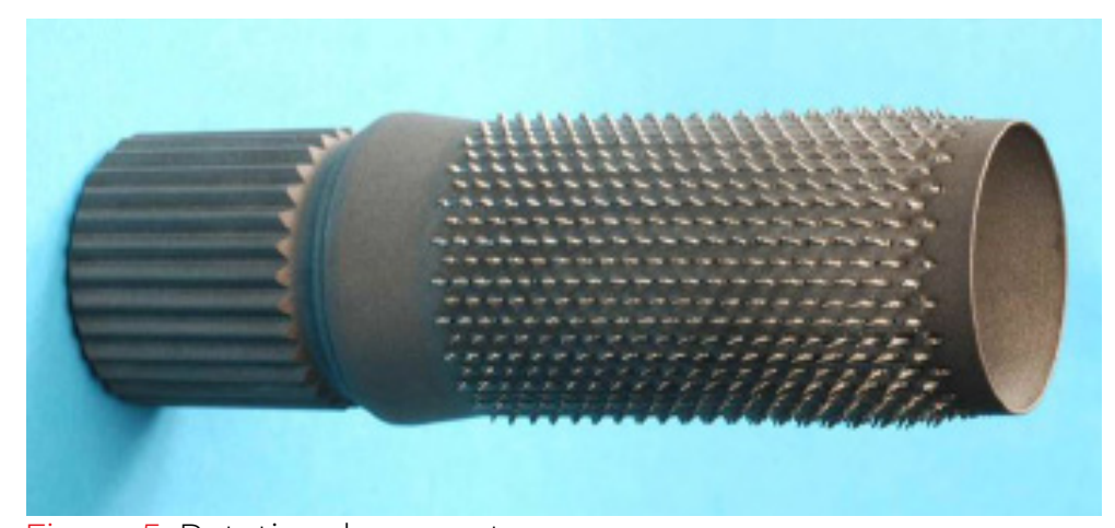
Figure 5. Rotational symmetry.

Internal or external screw threads can be added using Surfi-Sculpt, as well as criss-cross patterns for an enhanced grip.