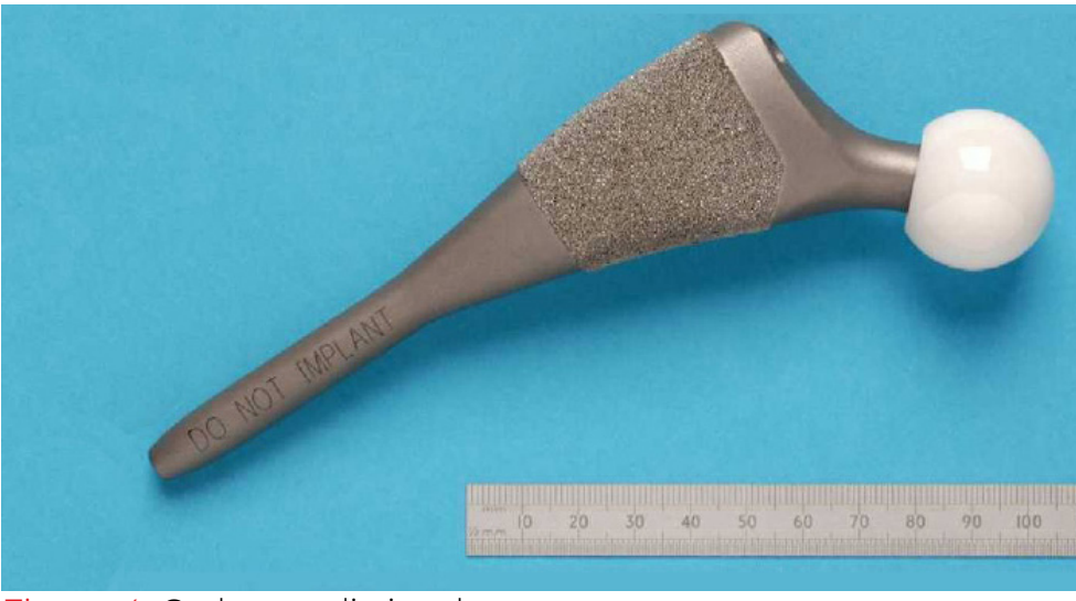
Figure 4. Orthopaedic implants.

This allows for design improvements, including implant fixation, product consistency, and successful integration.