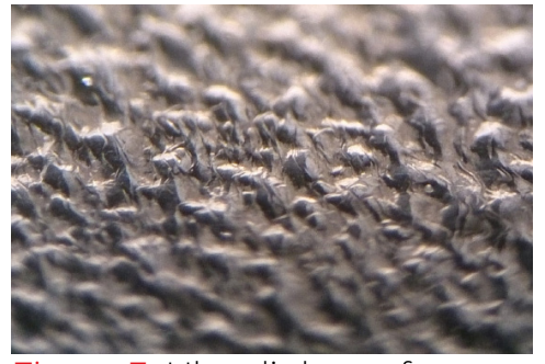
Figure 3. Ultra-light surface.